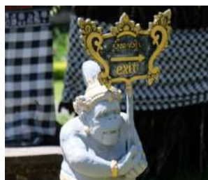
Bilingual LL (direction)