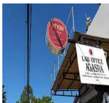
Figure 1 LL monolingual (English)