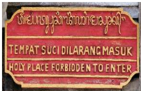
(own resource) Multilingual LL (direction)