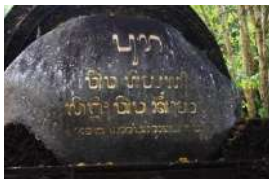
(own resource) Monolingual LL (inscription)