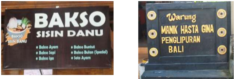
Bilingual LL (store)