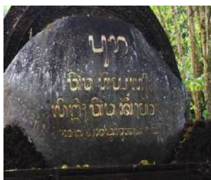
Monolingual LL (inscription)