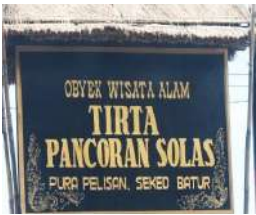
(own resource) Hybrid (a)

Related to the second research question, several evidences of lexicological processes in LL are found. The representative data of each category can be seen in Figure 6.