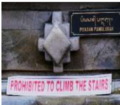
(own resource) Monolingual (b)