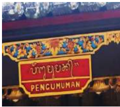
(own resource) Monolingual (c)