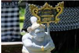
(own resource) Bilingual LL (direction)