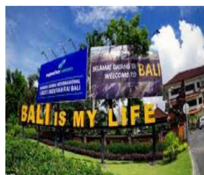
Figure 3 bilingual LL (Indonesian and English)

In the first research question, several LL images and their categories were presented as in the example above. Regarding the second, third, and fourth research questions, the data were presented in the form of paragraphs.