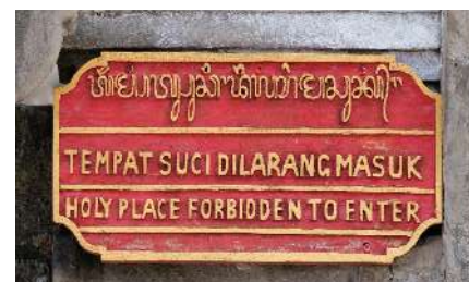
Multilingual LL (direction)

Balinese on LL with the bottom-up category consists only of bilingual. The representation of LL in the Balinese bottom-up variety can be seen in Figure 4.2. On the bilingual sign, Indonesian and Balinese are displayed together on LL in the tourist destination area in Bali. LL in the tourist city of Bali destinations from both the top-down and bottom-up categories are found in various places, such as places of worship, souvenir centers, and shops.