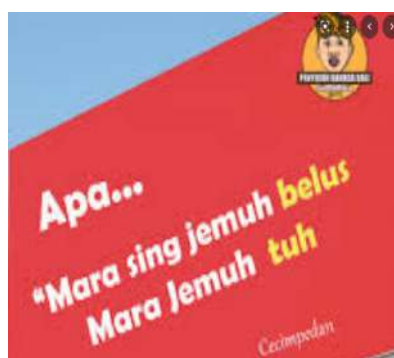
Figure 2 LL monolingual (Balinese)